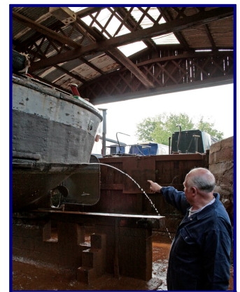
There was a "hole in our ballast tank"

On leaving Worsley Kennet stopped at Bedford Basin to have 8.5 tonne of concrete block & brick ballast added in 3 hours by a team of 6, before continuing on the journey home. This turned out to be an eventful journey when Kennet arrived at the basin at the bottom of the Wigan flight to find it was virtually empty after being vandalised that morning. Then at the 2 nd lock from the top at Johnson's Hillock the bottom gates wouldn't open enough for Kennet to get through, due to a build up of silt behind the bottom gates. This was cleared the next morning by BW. This isn't the first time this has happened – it really requires the lock to be drained and the whole of the lock to be cleared of silt to stop it happening again quickly!