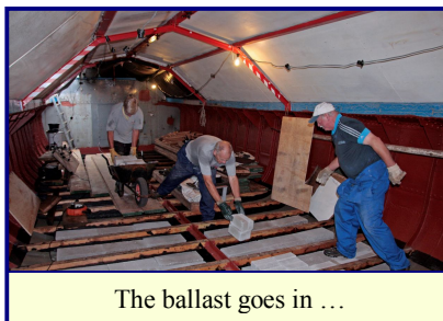
The ballast goes in ...

Kennet arrived back on her home mooring at Greenberfield on the 9 th September ready for the regular third Saturday of the month work day. This saw a second coat of paint applied on the hold sides, part of the floor in the front cabin being lifted to remove more scaling and rubbish in preparation for the same treatment as in the hold. A sterling start was also made in the engine room to clean the years of grime and treat the rust in preparation for painting.